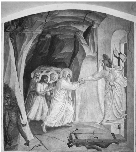
Christ in Limbo. Fra Angelico (c. 1441-1442)